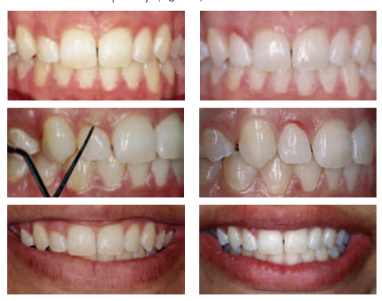
Figure 2: The upper right lateral incisor demonstrated a delayed migration of the gingival margin as indicated by a 3mm sulcus depth. A gingivectomy was performed to enhance the aesthetic result.

(i) If the shorter tooth has a deeper sulcus, excisional gingivectomy is indicated to move the gingival margin of the shorter tooth apically (Figure 2).