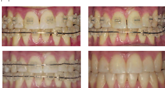
Figure 4: Interproximal stripping and orthodontic space closure eliminates the black triangle gingival to the central incisor contact.

The presence of a papilla between the maxillary anterior teeth is a key factor for an aesthetic smile. The presence of a space or "black triangle" above the interproximal contact is most often caused by abnormal tooth shape, where the crowns of the central incisors are much wider at their incisal edge than at the cervical region. It is also commonly seen in patients with advanced periodontal disease, or in patients with longstanding overlapped anterior teeth. This situation is best corrected by recontouring the proximal surfaces of the teeth. A diastema is created and orthodontics is used to close the space (Figure 4). As this occurs, the contact is lengthened and moved toward the papilla.