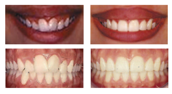
Figure 1: This patient demonstrated a "gummy smile" from delayed apical migration of the gingival margins. After orthodontic treatment, an excisional gingivectomy was performed on the six upper anterior teeth to reduce the gingival display on smiling.